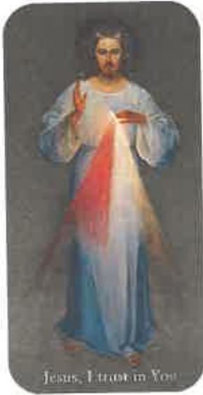
Image of The Divine Mercy and Its Promises