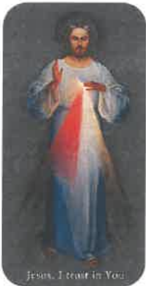
Image of The Divine Mercy and Its Promises