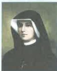
SAINT FAUSTINA Pray for us!