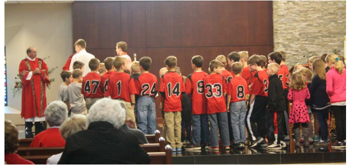
- Young athletes at St. James attend the Sports Mass, May 15, 2016

St. James also says "Yes." Even beyond the required seasonal coaches' meetings under the Youth Sports Charter, our parish and athletic club sponsored the authors of this article to attend the 3-day sports ministry conference last Spring. Each of our baseball teams then enjoyed an opening day ceremony at St. James field, with both teams and