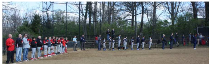
--St. James 13U National baseball team enjoys prayer & national anthem with St. Catherine's before Opening Day 2016

all the fans participating in public prayer followed by our national anthem before the first pitch. (Yes, we were leaders in making pre-game ceremonies relevant -- in a positive, faith-based way -- before pre-game activity became national news.)