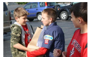
Children's Liturgy, and the Food Drive at the Spring Sports Mass