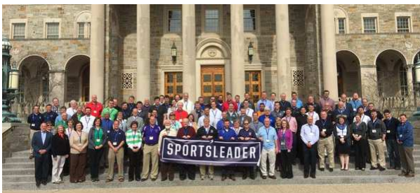
--A Papal representative joined Bishops, coaches and others at the Athenaeum Mar 30–Apr 1.