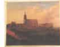
St. James Print $35