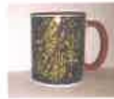
Coffee Mug $10