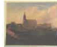
St. James Print $35