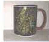
Coffee Mug $10