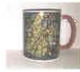
Coffee Mug $10