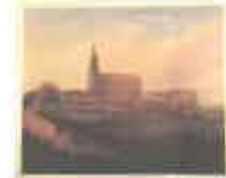
St. James Print $35

A brochure containing the Calendar of Events planned during the year will be available. You can also pick one up in the parish office.