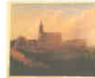
St. James Print $35