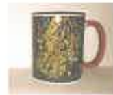
Coffee Mug $10