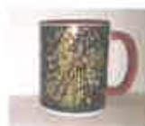
Coffee Mug $10