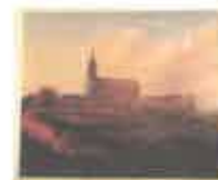
St. James Print $35