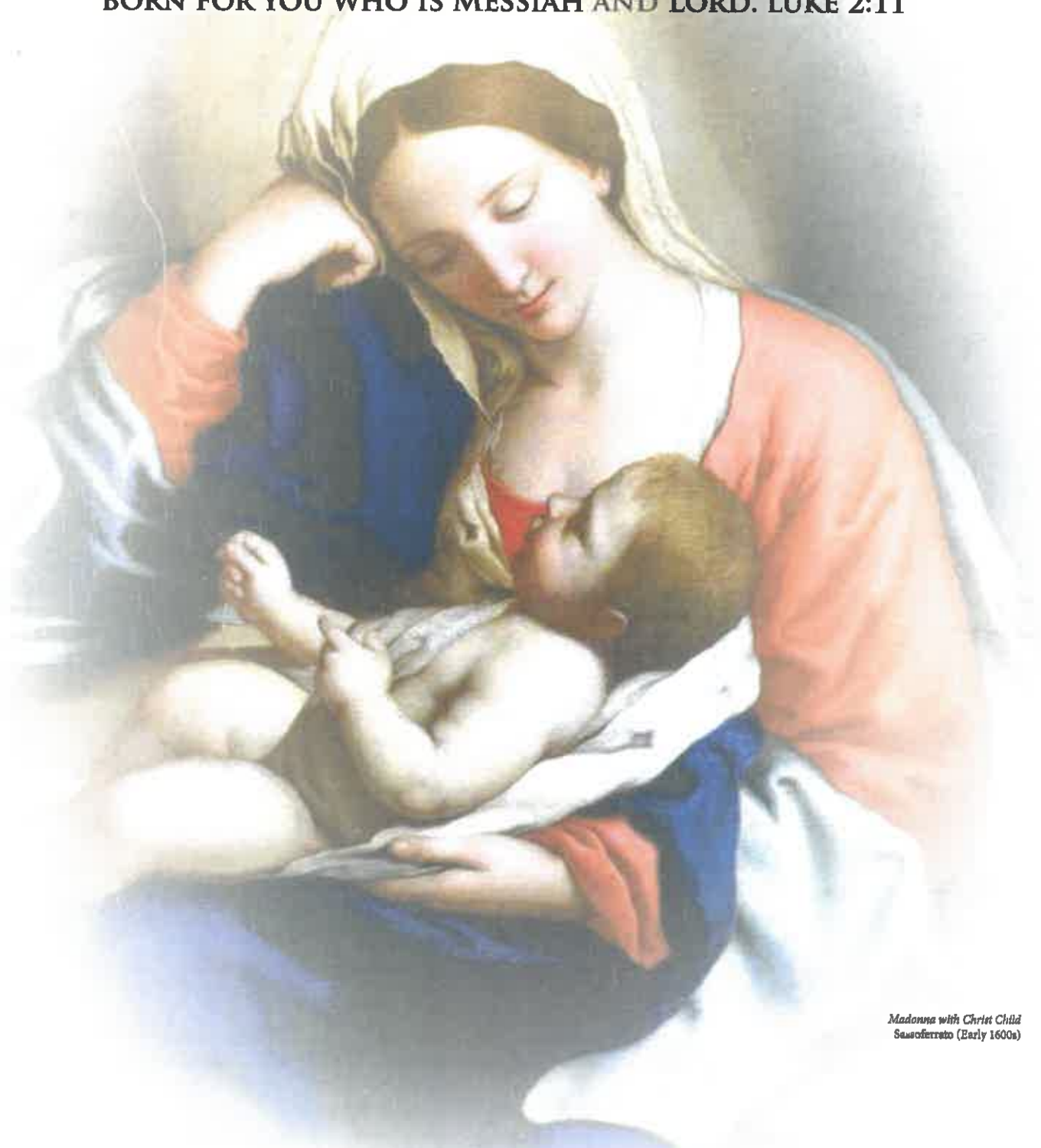
Madonna with Christ Child Sassoferrato (Early 1600s)

FOR TODAY IN THE CITY OF DAVID A SAVIOR HAS BEEN BORN FOR YOU WHO IS MESSIAH AND LORD. LUKE 2:11