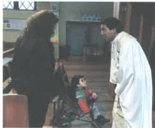
A Missionary visits with parishioners after Mass in rural Chile.

One example is the Missionaries' nutrition project in the La Labor region of Guatemala.