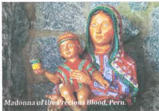
Madonna of the Precious Blood, Peru.

Missionaries throughout the world learn so much from the people they serve. (Missionaries in ministry in Peru, left and Colombia, below.)