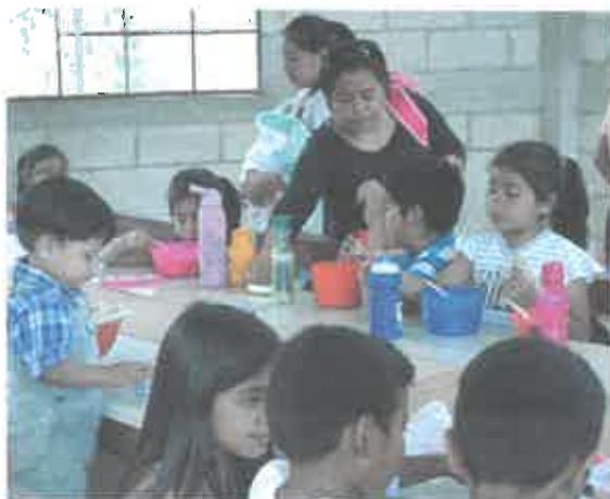
Lunch is served at the nutrition project in Guatemala.

We're working with lay volunteers who cook lunch several times a week in a simple kitchen behind Our Lady of Carmel Chapel. They serve a hot, nutritious lunch to the dozens of young children who come from miles around. Malnutrition is a real problem in Guatemala; volunteers track the children's weight to be sure the project is helping—and it is!