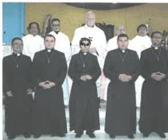
Seminarians gather at a mass in Colombia.