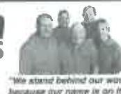
"We stand behind our work because our name is on it."

(513) SER-VICE • (513) 737-8423 www.herrmannservices.com