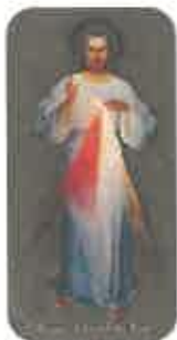
Image of The Divine Mercy and Its Promises

Good Friday is an obligatory day of fasting and abstinence for Catholics. In addition, Fridays during Lent are obligatory days of abstinence from meat and meat products. The norms on fasting are obligatory from age 18 until age 59. When fasting, a person is permitted to eat one full meal. Two smaller meals may also be taken, but not to equal a full meal. The norms concerning abstinence from meat are binding from age 14 onwards.