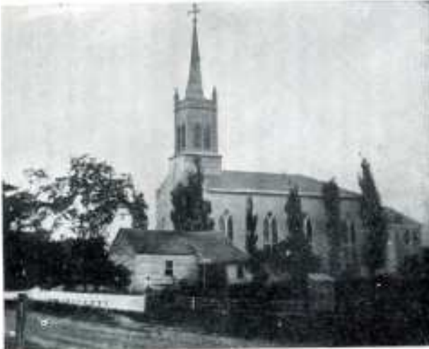
The church built in 1849