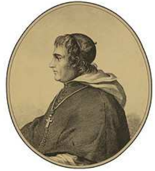
Bishop Edward Fenwick, O.P.

We Pray that Our Gifts Continue to Give. . .