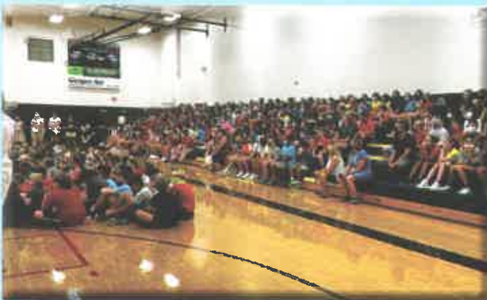
The students were blessed to be back together again at the opening day prayer service.