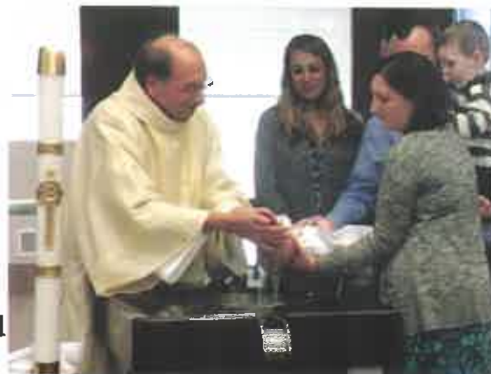
Baptism of the youngest grandchild.

As we mourn the loss of our long-time parishioners who sacrificed much to build and main-