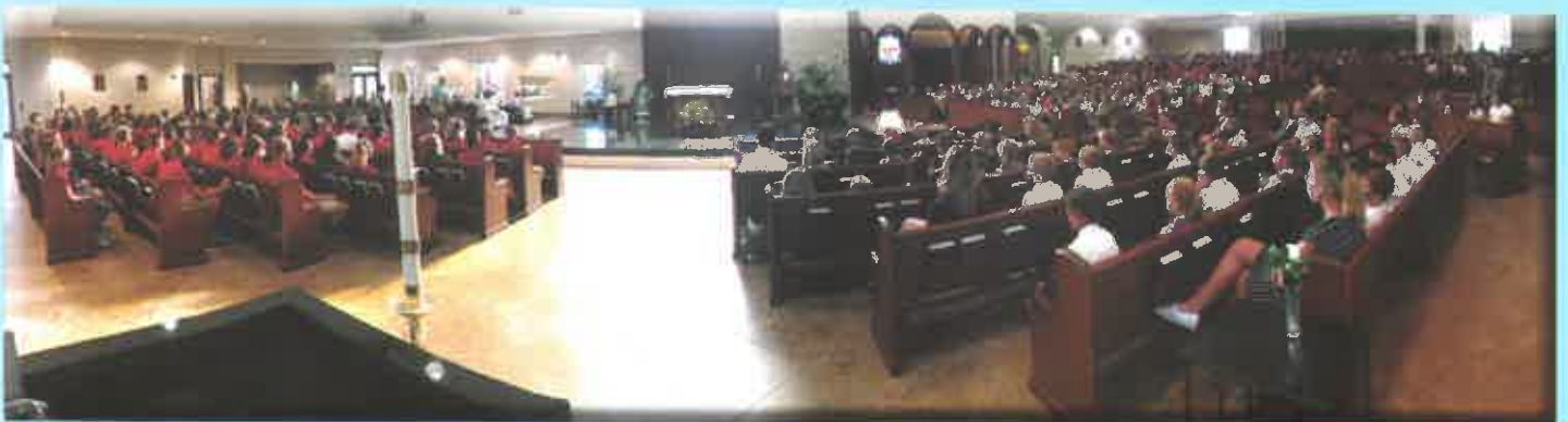
Opening school Mass brought the whole school together for the first time in over a year and half.